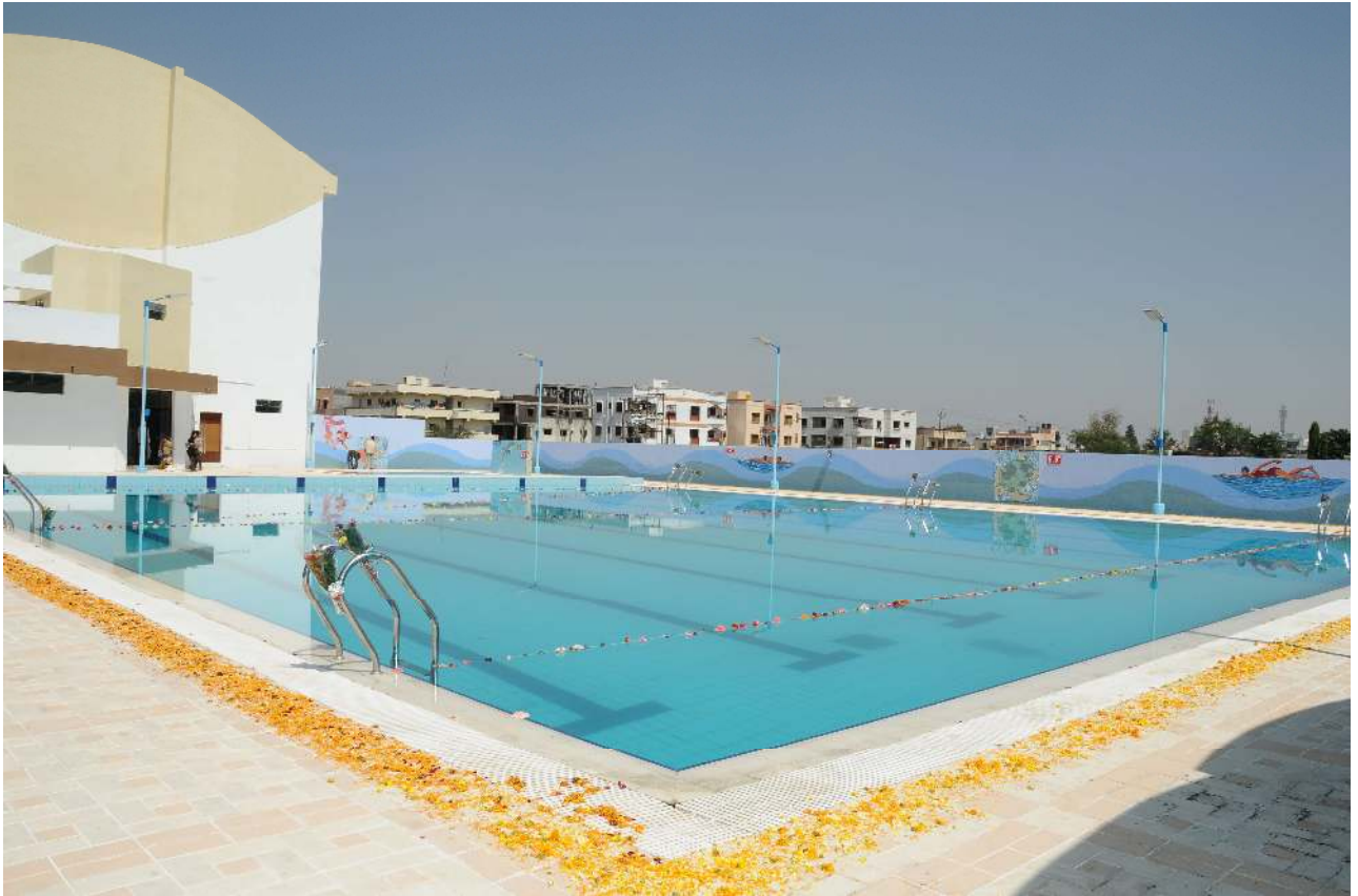
Commercial Swimming Pool