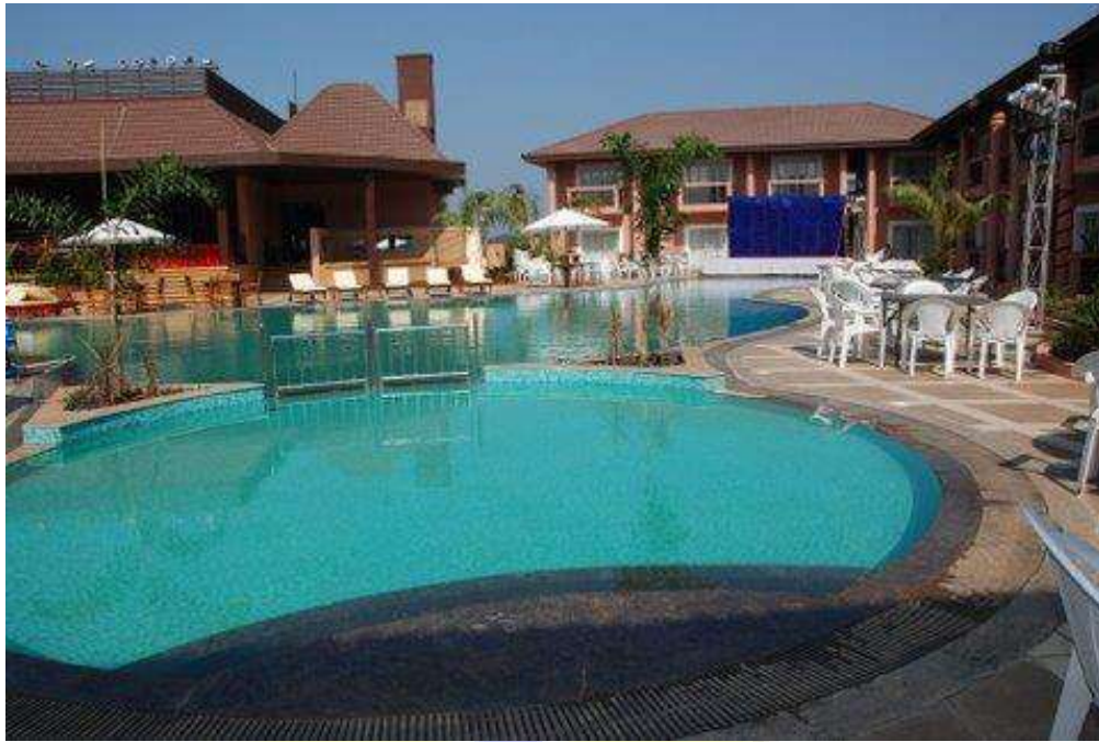
Commercial Swimming Pool