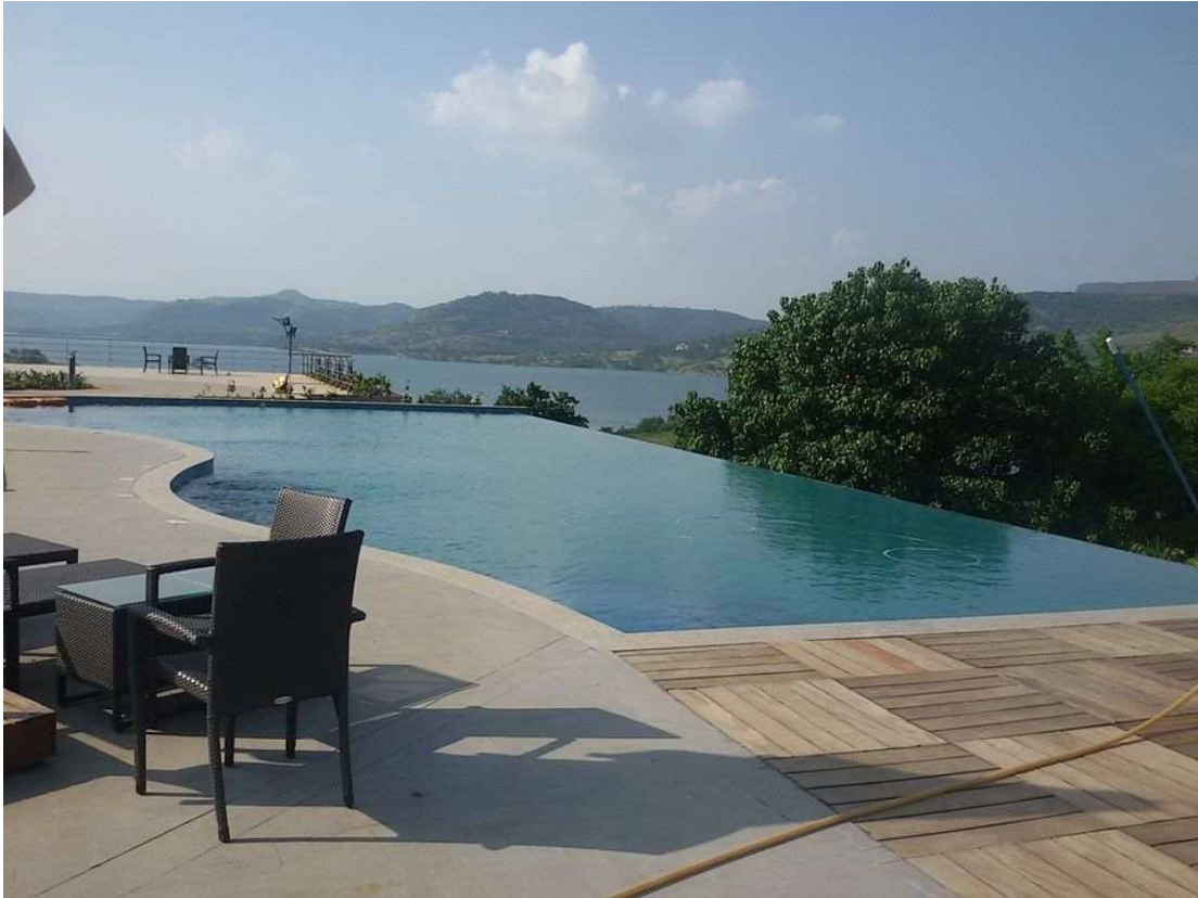
Overflow Type Swimming Pool