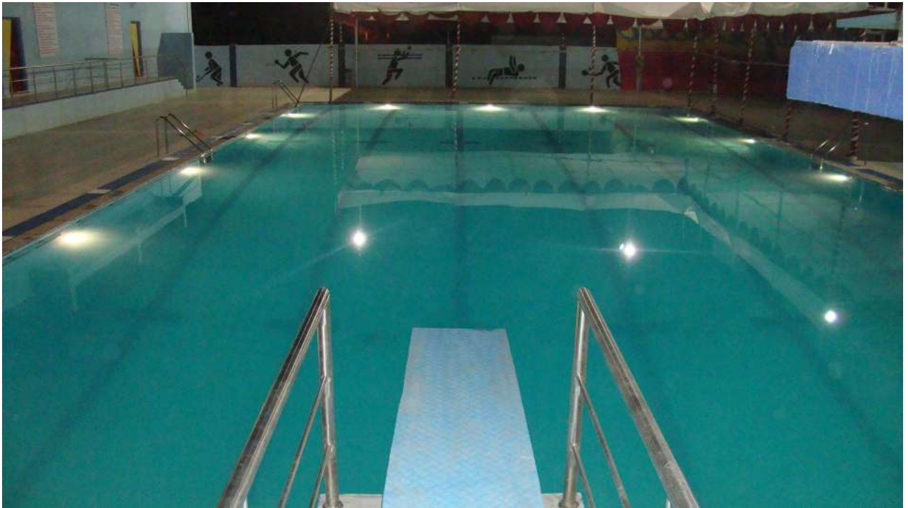
Commercial Swimming Pool